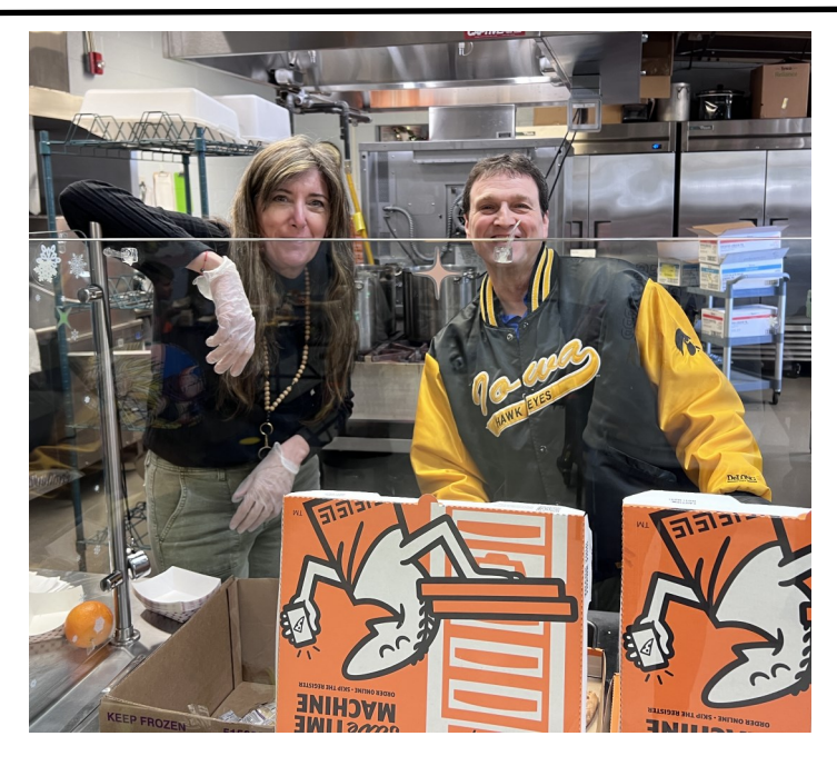
Pizza Pie Day at the elementary school